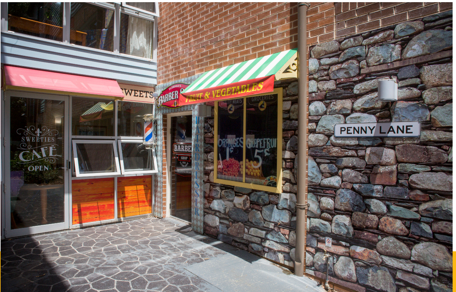
Top left - Receive professional care with a personal touch.