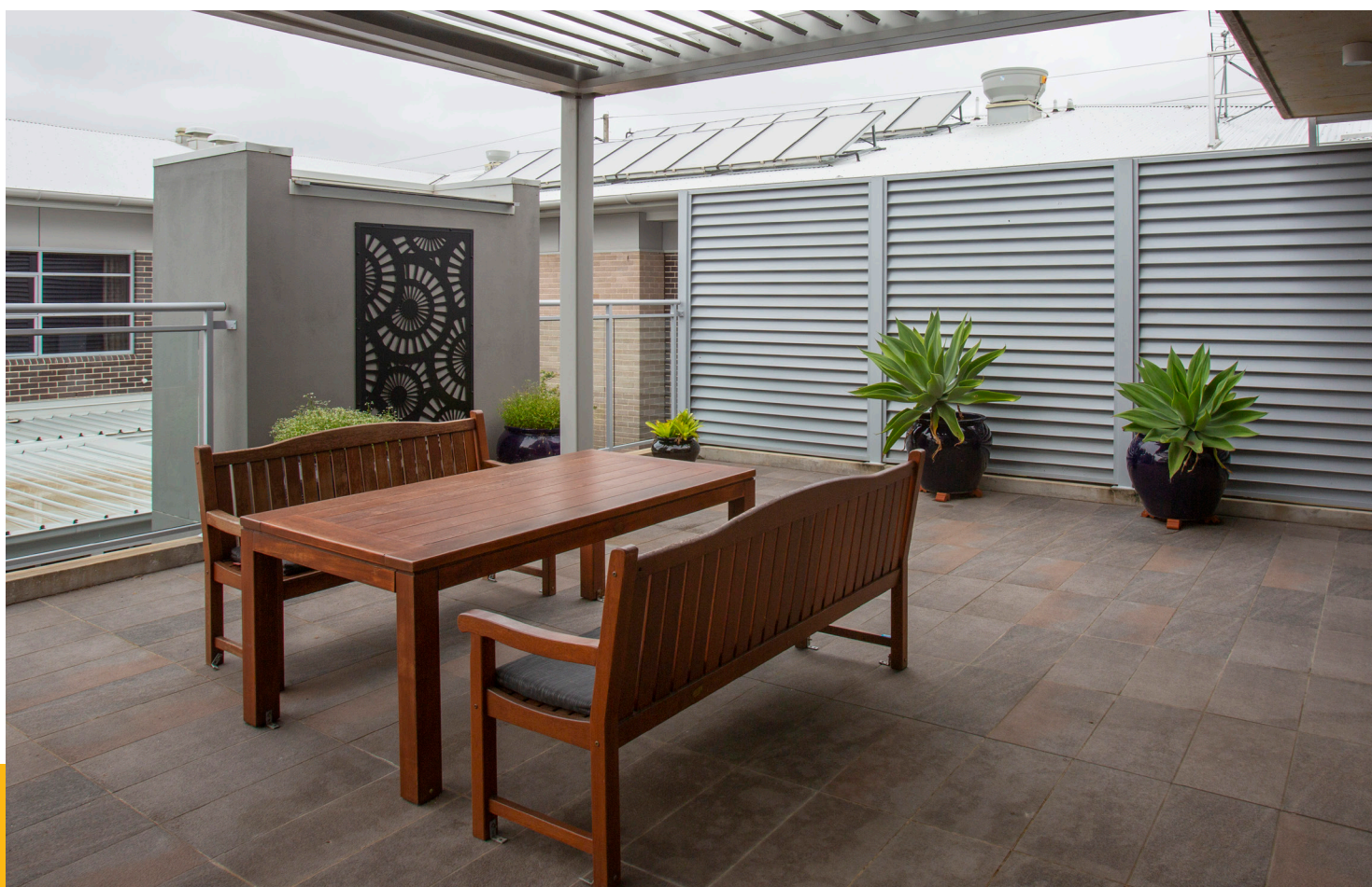
Top left - Receive professional care with a personal touch at IRT Tarrawanna.